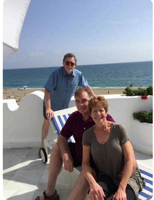
Marbella, Spain 2016