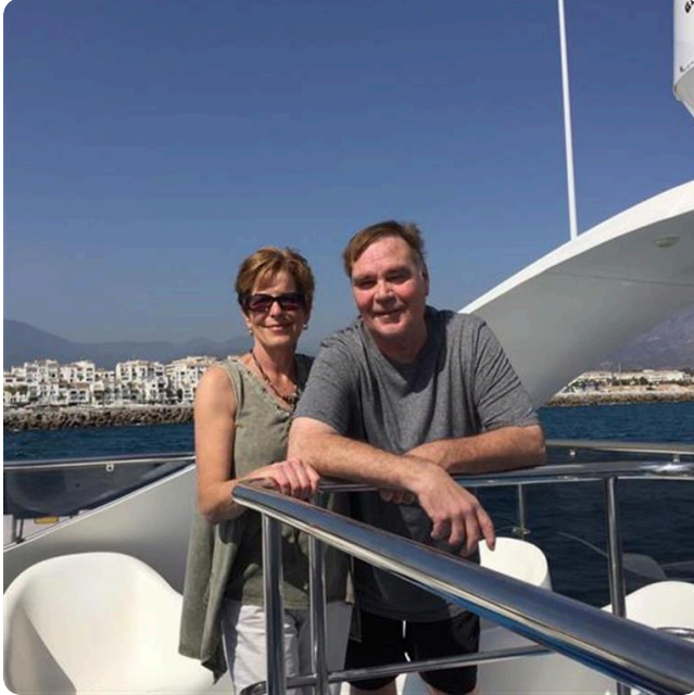
Puerto Banus Spain, 2016